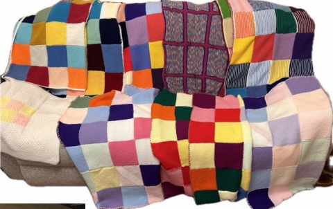
all your donations of wool we have received this year it is good to know we have been able to use the wool on various projects.

We have already started knitting squares for next year's blankets. Thank you very much for